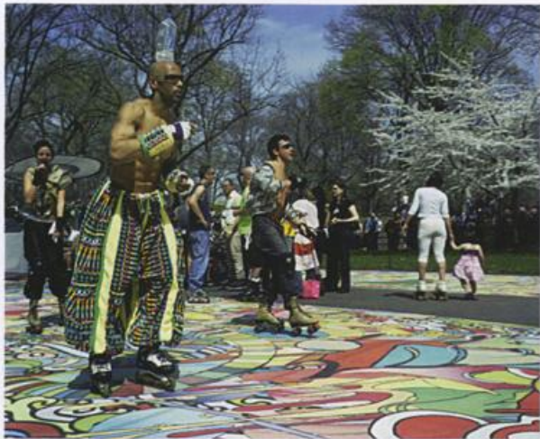
"assume vivid astro focus IX", April-September, 2004. Part of Public Art Fund's program, "In the Public Realm", (in collaboration with the Whitney Biennial), Central Park, New York.