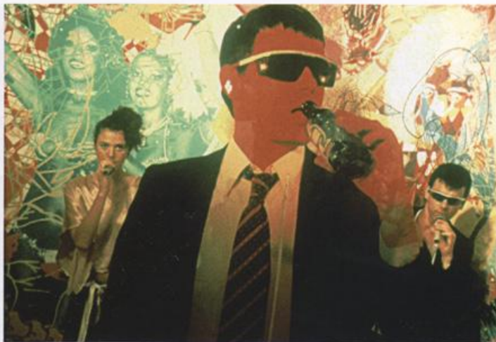
Garden X, from "assume vivid astro focus VII", 2004. Featuring Los Super Elegantes. Detail. Whitney Biennial, Whitney Museum of Art, New York.

tainment? Of course, it isn't even clear if this choice is a viable one within this new frame of reference. (Maybe real dissent, the possibility of an effective adversarial stance, is assumed foreclosed.) This leads to the second problem, that of mapping this new situation. I think we're at a point where younger artists are still attempting to figure out exactly how to work within the new set of rules.